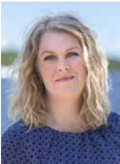
Lena Hallengren, Chair of the Swedish Parliament Standing Committee on Education